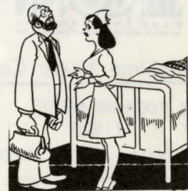
Better change his medicine, doctor. He's not doing so well—He's quit chasing me around the room.