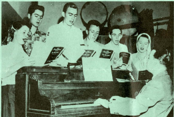
DOUBLE QUARTET PRACTICING FOR XMAS PROGRAM