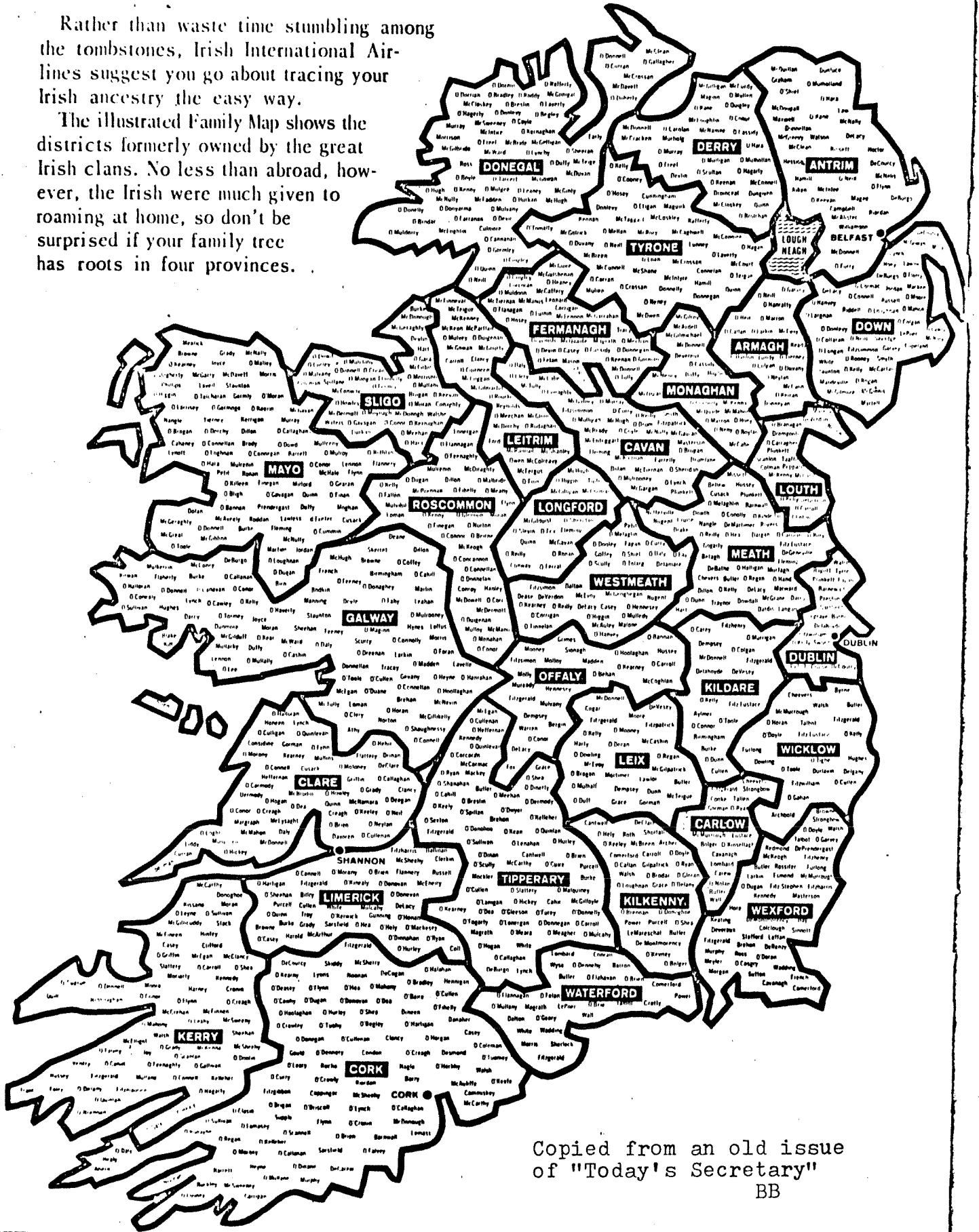
Copied from an old issue of "Today's Secretary"

The illustrated Family Map shows the districts formerly owned by the great Irish clans. No less than abroad, however, the Irish were much given to roaming at home, so don't be surprised if your family tree has roots in four provinces.