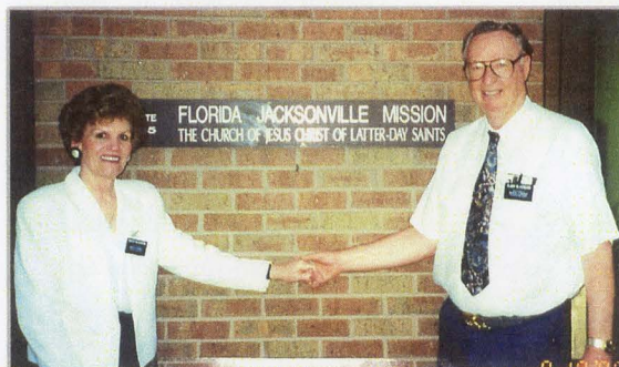
Blessed to serve in the Florida Jacksonville Mission