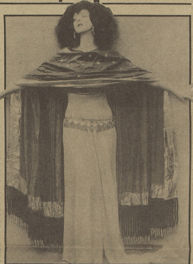
RUTH ST. DENNIS