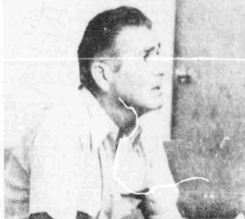
GHETTO — "Instead of West Las Vegas, some day it'll be East Henderson. It could, you know."

Development had said on May 10 Henderson persistence in wanting Carver Park as the site for the 80 units remaining to be built as part of the city's agreement with the Clark County Housing Authority might jeopardize HUD funding of other city projects--ed.) That's blackmail.