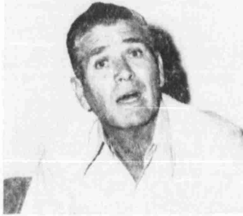
HOUSING — "Henderson has to have diversified growth. It can't just be county welfare cases."

A. Both. I don't know, maybe this is where my