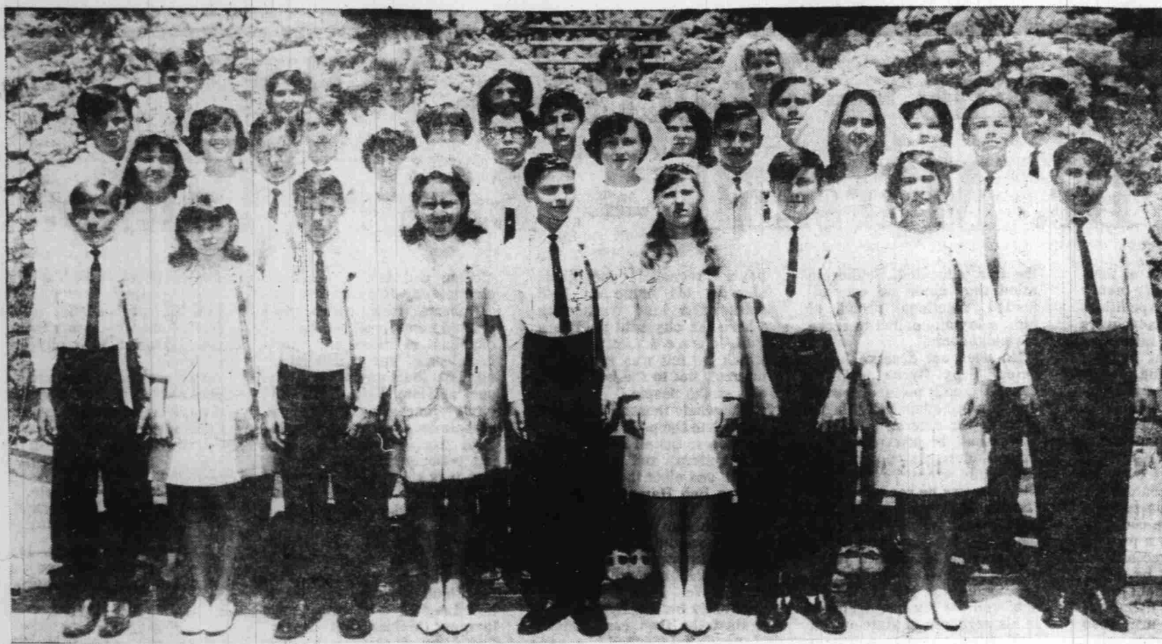
ST. PETER'S CATHOLIC SCHOOL HOLDS GRADUATION EXERCISES. Pictured are students of the 15th class to graduate from St. Peter's Catholic School. Graduation exercises were