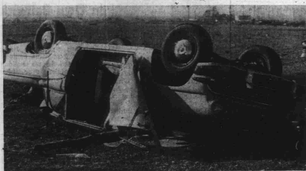
SIX TEENAGERS WERE INJURED early yesterday morning when this car landed on its top at the Thunderbird Drag Strip after the driver lost control and the vehicle landed on its top. Four of the young people suffered only minor injuries, while two others were seriously injured in the "unscheduled drag race."

For example, acreage which was raw-desert land when acquired by the City by purchase from the Federal Government has been resold to private interests, much of it has been improved by these private interests and by the City. These properties, improved and unimproved, will be re-evaluated to establish an assessed valuation of 35 per cent of their present cash values, resulting in increased tax income to Henderson and Boulder City.