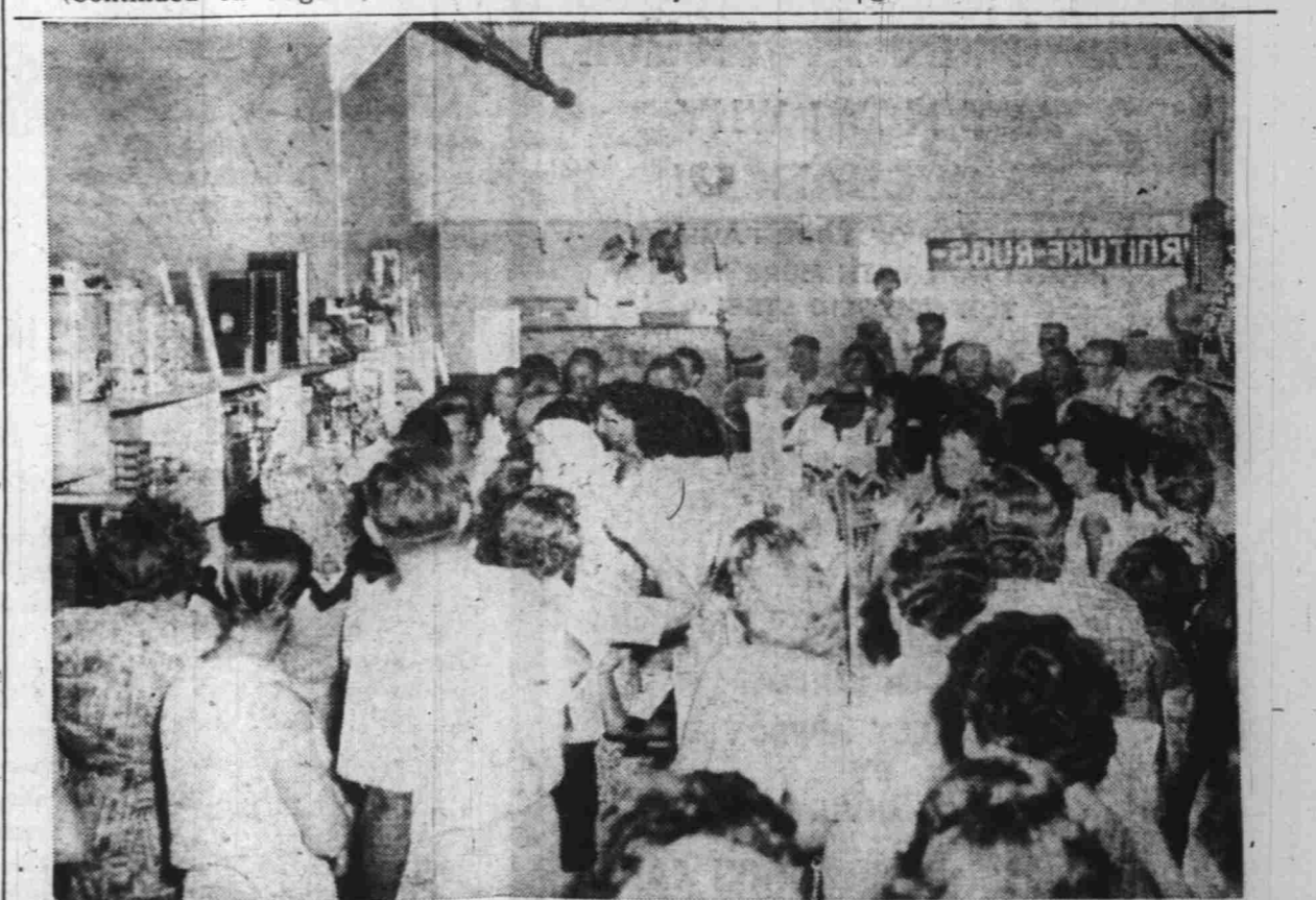
"SOLD FOR ONE DOLLAR"—That's what some of the items are being sold for at A & C Merchandise on Market St. Doors opened yesterday morning and a full scale auction will be in progress until most of the merchandise is sold.