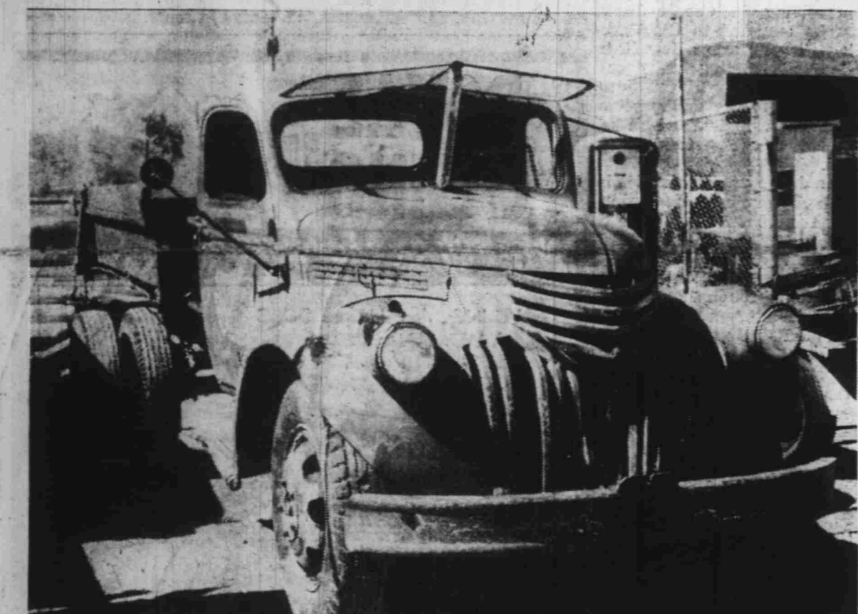
DUMP TRUCK IS DUMPED — a ton and a half 1942 dump truck was still used by the city maintenance workers up to about a year ago, when it broke down. A new four yard two-ton dump truck is one of the pieces of equipment that the city will open bids for the fifth of September.