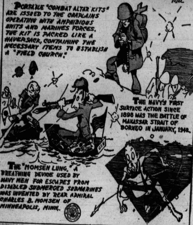
PORTABLE "COMBAT ALTAR KITS" ARE ISSUED TO THE CHAPLAINS OPERATING WITH AMPHIBIOUS UNITS AND MARINES FORCES. THE KIT IS PACKED LIKE A HAVESACK, CONTAINING THE NECESSARY ITEMS TO ESTABLISH A "FIELD CHURCH."