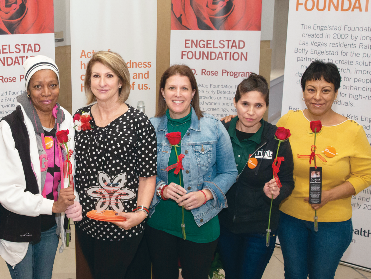
Exceed Photography, Inc., Edyta Sokolowska-Kelly