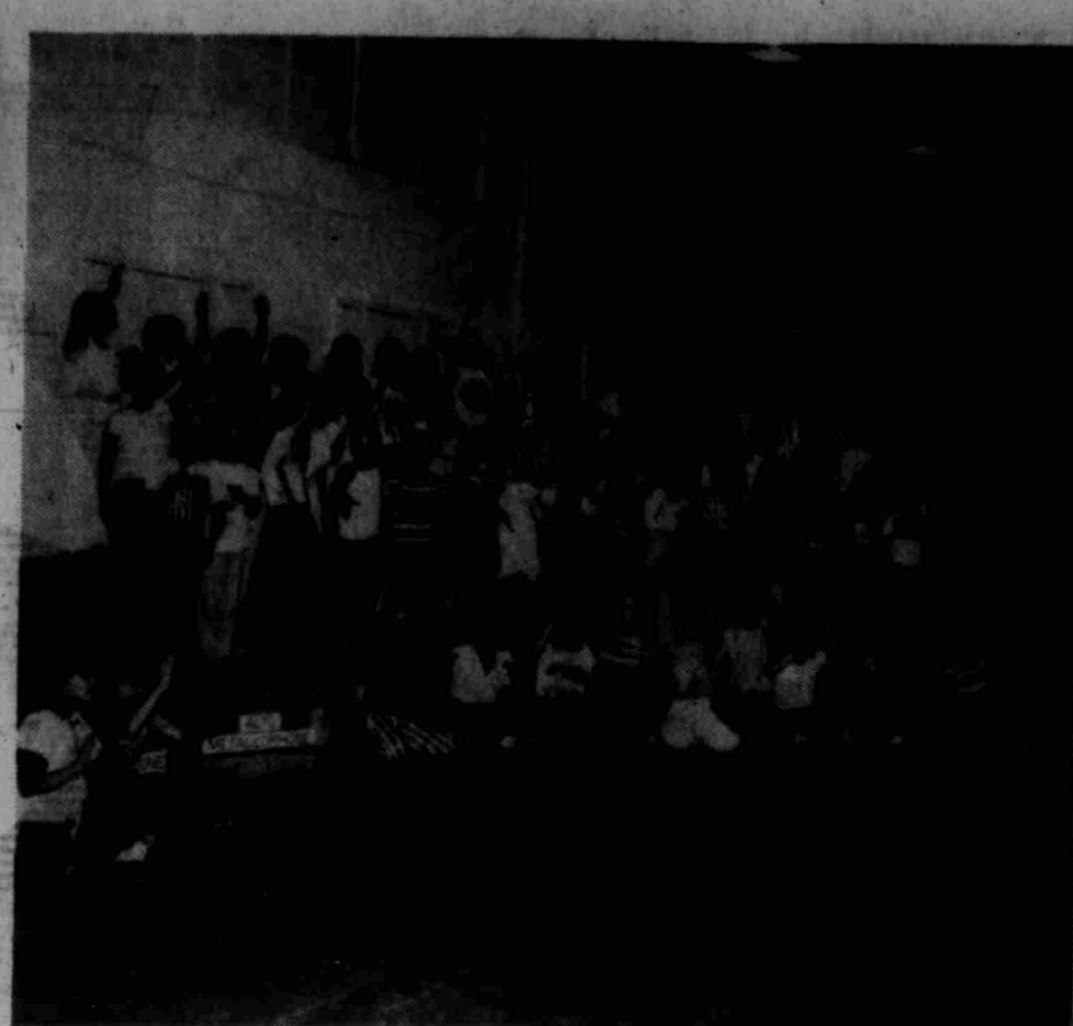
STUDENTS from Robert Taylor Elementary School put on a musical program for their parents during the last days of school. Pictured above