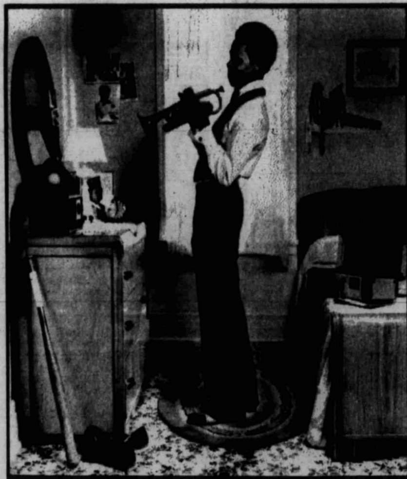
He could almost hear the crowd cheering as he fingered the battered old trumpet in his hands.

Its first use for treatment of night leg cramps, in 1940, followed a report that it