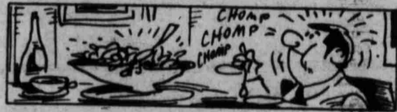
Chewing uncooked parsley can help remove garlic from the breath.