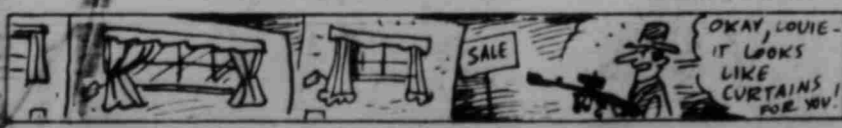
A four- or five-inch hem is a good idea for curtains. If they shrink, they can be let down, and the extra weight at bottom makes them hang better.