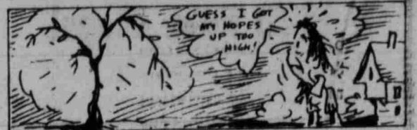
Some people believed that their lives were bound up with that of a tree—if it flourished, so would they.

The lodge is located at 637 Lake Mead Drive.