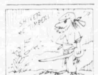
Some people believe that goldenrod grows over buried treasure.

There will be 60 children in the production with songs and skits. Depicting the various parts of the country there will be a rope twirling act, cheerleaders who do "On Wisconsin," and other regional acts. A number of dignitaries from the school district, from the Bicentennial committees of the county, Las Vegas, North Las Vegas and Henderson, the Henderson Mayor and others, have been invited.